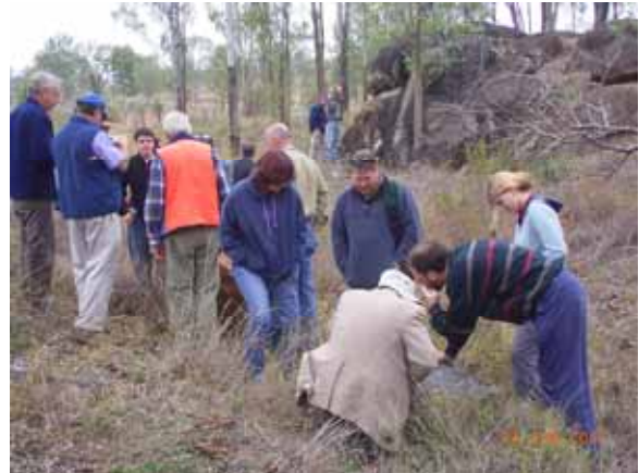
Participants inspecting magma mixing within the Eidsvold Igneous Complex near Spring Gully Road, west of Eidsvold.

We stopped not long after at the Cracow mine office for a briefing from our hosts (for the day) from the Newcrest team who gave us a comprehensive run down on the Cracow gold deposits (quartz veins and shoots in early Permian andesitic volcanics of the Camboon Volcanics at the base of the Bowen Basin), including their history, geology, geophysics and the intricacies of the mineralisation styles and their distribution. We moved on to the core farm where we were